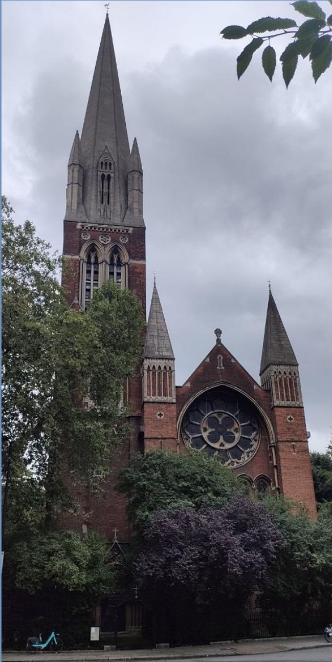
St Augustine's Kilburn